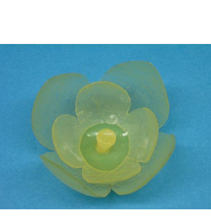
Complex arrangements are easy with Bond.