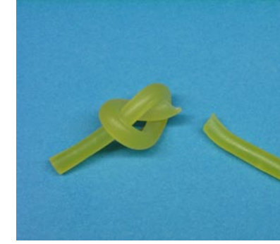
Little accidents ...

... can be fixed easily with Bond, the light curing glue.