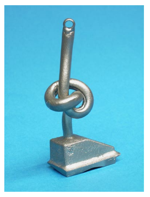
Imagination frozen in metal.