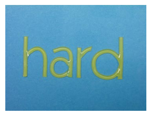
the material hardens.