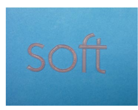
A variety of soft uncured shapes ...

NoWax resin burns out cleanly during lost wax casting.